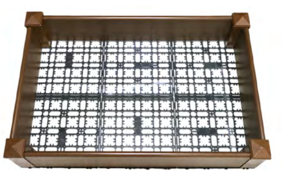
PB_2 x 3 H 245 x L 1095 x W 730 mm