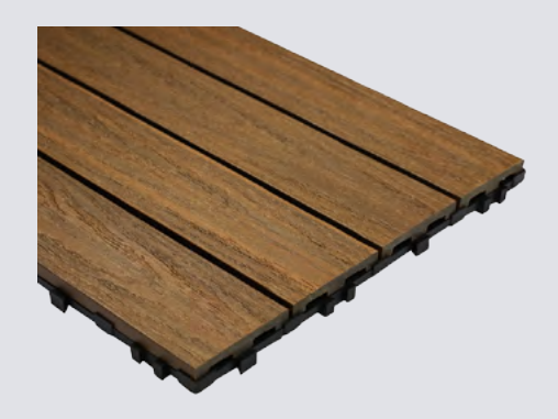
Capped Composite Deck Tile Pre-assembled on a Interlocking base