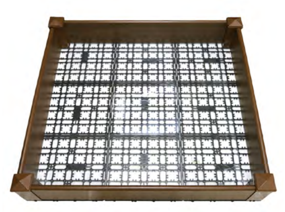
PB_3 x 3 H 245 x L 1095 x W 1095 mm