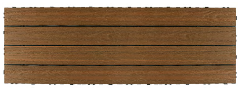
900 x 300 mm (35.4 x 11.8 in)