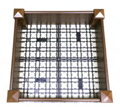
PB_2 x 2 H 245 x L 730 x W 730 mm