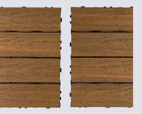
Striking color with anti-UV additivies