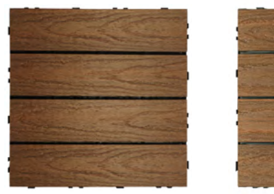
300 x 300 mm (11.8 x 11.8 in)